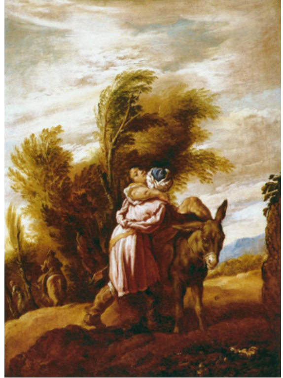
"Good Samaritan" by Domenico Fetti

If you can't make your date, please find a replacement and let the office know.