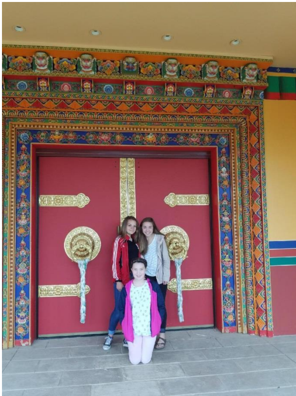
Confirmation Class in front of Buddhist Temple doors on their visit in May.