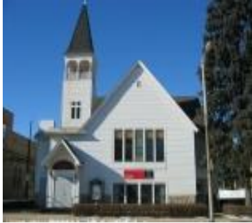
9:30 AM-September 4 Sunday Worship Service