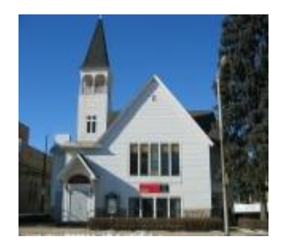
9:30 AM Sunday Worship Service